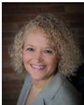
Jackie Biskupski, SLC Mayoral Candidate

3 I have strongly opposed the relocation of the state penitentiary to Salt Lake City. My administration is assessing strategies we might pursue to prevent the prison from moving to Salt Lake City. Because of its proximity to the Great Salt Lake, there is exceptionally high risk to inmates and infrastructure in the event of an earthquake. Also, the site is adjacent to an old landfill. Due to high ground water levels there, any excavation work may draw water and environmental contaminants from the old landfill property offsite. I remain staunchly opposed to relocating the prison to Salt Lake City, and I will continue to fight its development. I also recognize the unfair burden the west side plays in halfway houses. I have been opposed to expanding these facilities in west side neighborhoods and will continue to support zoning and other land use changes that make it more difficult for them to be located just in west Salt Lake.