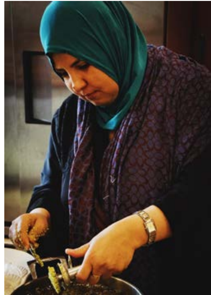
An Iraqi woman drops a falafel croquette into hot oil for frying" – Photo from "Savor – Stories of Community, Culture, and Food," p.26.