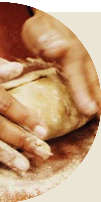
aloo paratha, "whole wheat flat bread, often eaten for breakfast in Nepal and Community, Culture, and Food," p.46.