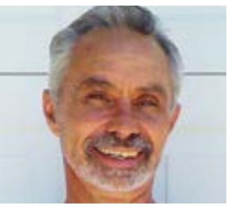
Dan Potts WEST VIEW MEDIA